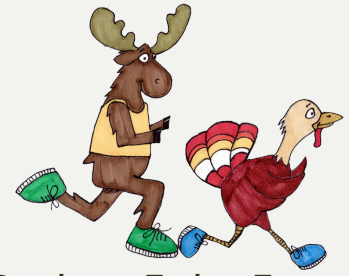
Roadtown Turkey Trot