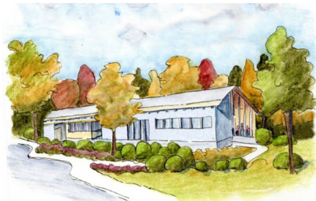
Artist rendering of the new Shutesbury Library

We are now looking to our broader community to clear the last hurdle. Please consider supporting us by signing on as a sponsor for our Roadtown Turkey Trot.